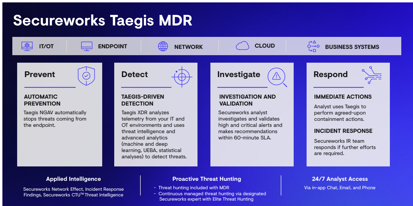
Figure 1. Taegis MDR

Taegis MDR enables your team, however advanced, to deal with an increasing workload and threat volume. We bring our expertise into your daily operations. Your team can collaborate with us on hunts, chat with our analysts, and periodically assess your security posture.